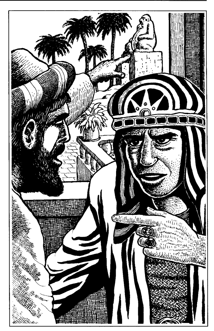
God's prophet warned King Amaziah that he would be destroyed for worshiping the Edomite idols.

"God will destroy you for your idolatry," the prophet continued. "This will